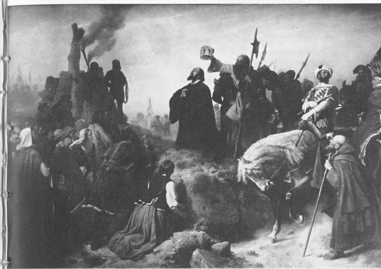
The Martyrdom of Huss by Carl Friedrich Lessing, 1850. The painting which measured approximately 12 by 18 feet has not been located since World War II.